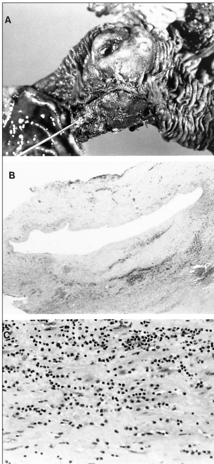
FIG. 3. (A) Operative specimen from the Whipple procedure. The resected portions of the duodenum showed the papillae and the tumour. A metallic stylet cannulates the papillae. (B) Low magnification of a transverse section from a resected mesenteric vein demonstrates invasion of the vessel wall by mesenchymal tissue (hematoxylin–eosin stain, original magnification \times 40 ). (C) The microscopic morphologic features of the specimen include spindle-shaped cells in a loose myxoid stroma heavily infiltrated by inflammatory cells (hematoxylin–eosin stain, original magnification 25 \times 20 ).

provement in peristalsis and pulsation of arcade vessels. The papaverine drip was stopped on the fifth day and her abdominal wall formally closed on the sixth day after the initial operation. She recovered fully and was discharged 28 days after admission. She returned to normal activities within 3 months of the initial operation and she was well at follow-up 3 years after surgery.